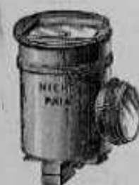
No. 7 View Finder.

With circular body, and square concave lens; ground bubble; very sensitive.