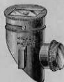
No. 6 View Finder.

This is similar to No. 1, but has a circular body, and the lens project a little, remarkably neat pattern, with very sensitive bubble.