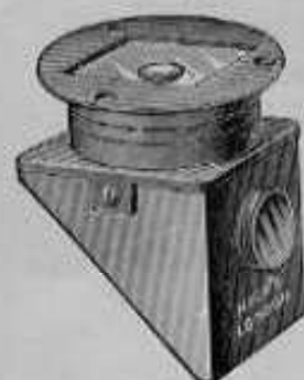
No. 3 View Finder.

With square body and round convex lens; also circular bubble, very sensitive, having the under side of upper glass ground.