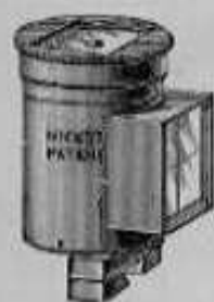
No. 5 View Finder.

This is similar to No. 1, but of larger size. It is equally sensitive, but is more appropriate for large Cameras.