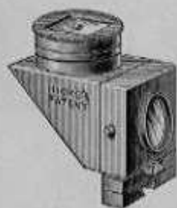
No. 1 View Finder.

With square body and round convex lens; also circular bubble, very sensitive, having the under side of upper glass ground.